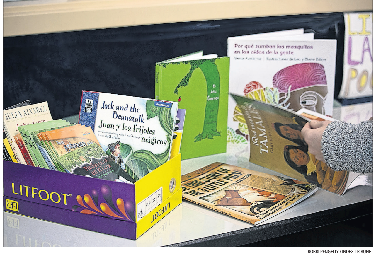
Some of the bilingual books purchased with Classroom Grants funding from the Sonoma Valley Education Foundation on April 5 at Altimira Middle School.

"Most of my students are third-culture kids,'